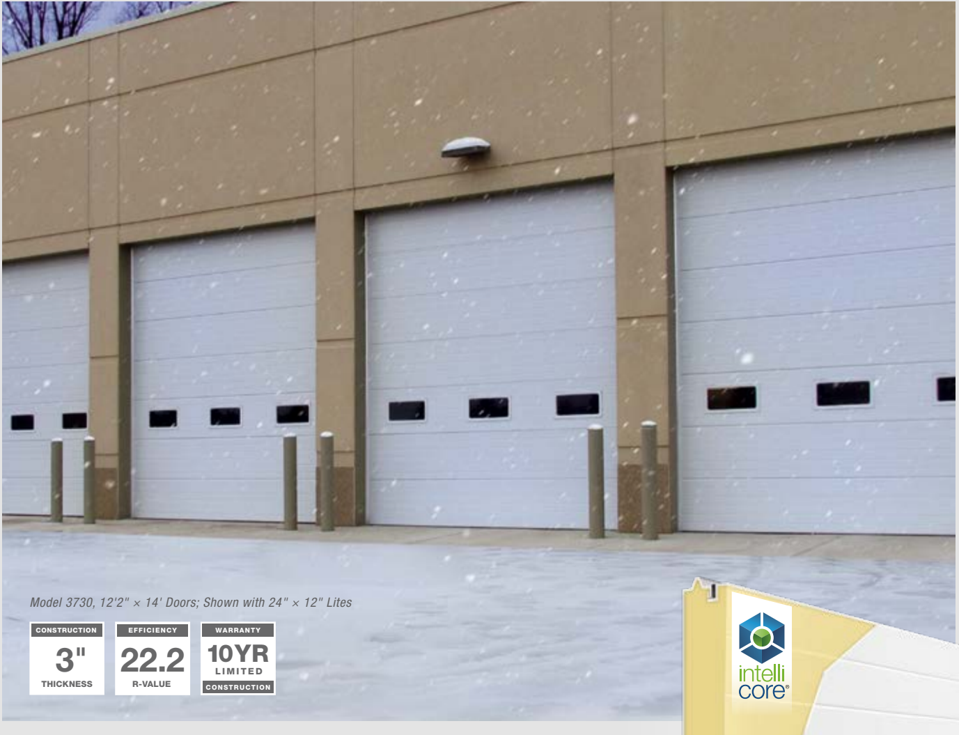
Model 3730, 12'2" x 14' Doors; Shown with 24" x 12" Lites