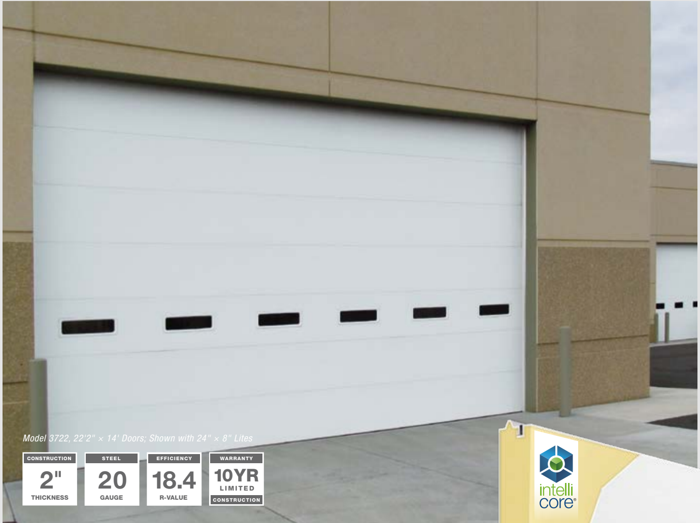
Model 3722, 22'2" x 14' Doors; Shown with 24" x 8" Lites