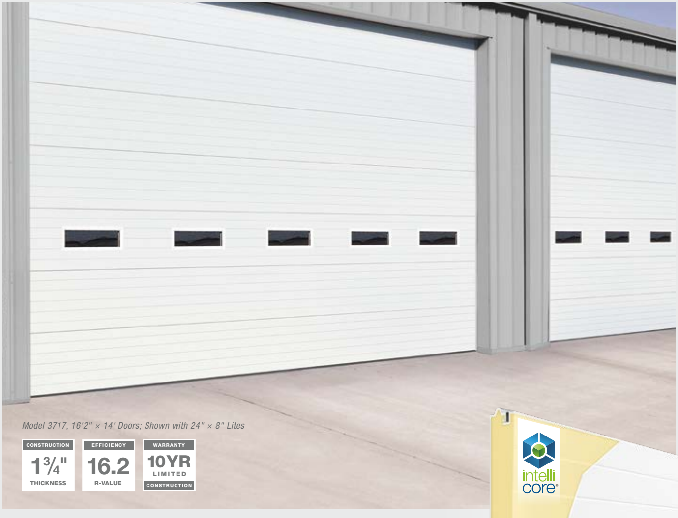
Model 3717, 16'2" x 14' Doors; Shown with 24" x 8" Lites