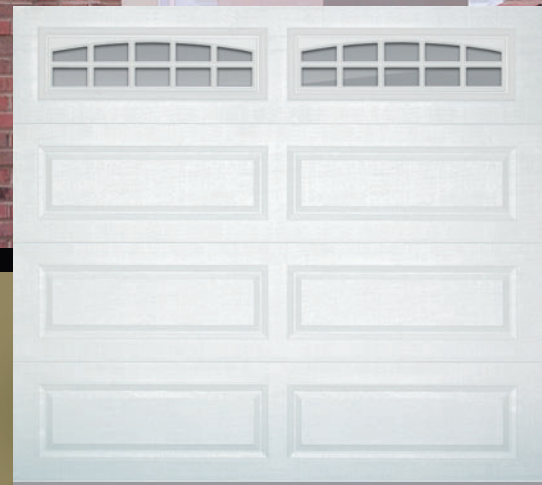
8' x 7' 4216 white with optional cascade window inserts