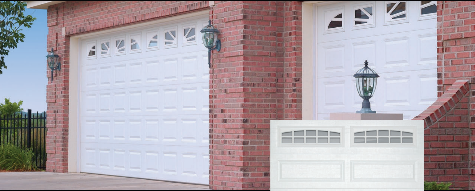
Pictured. 16' x 8' 2216 white with optional 2-4 pc sunburst windows, 9' x 8' 2216 white with optional 4 pc sunburst windows