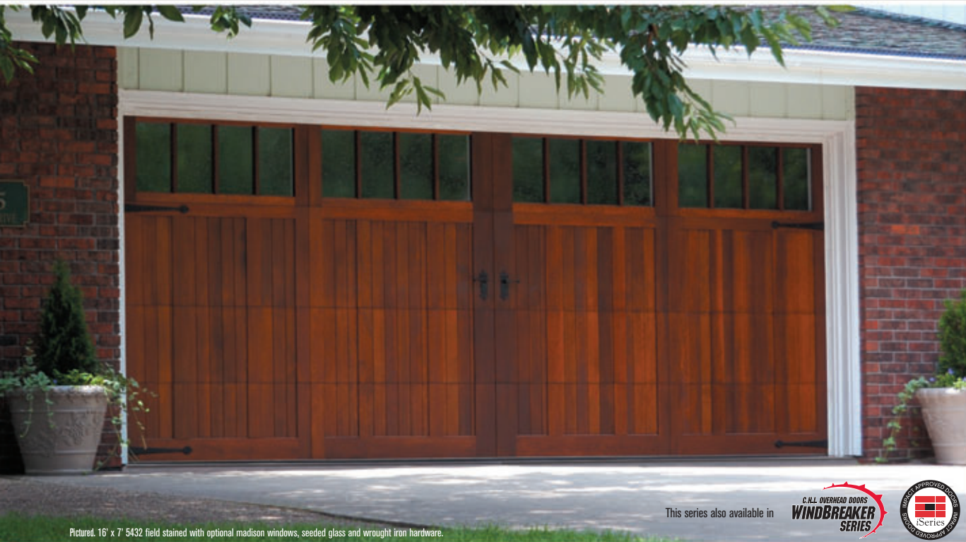
Pictured, 16' x 7' 5432 field stained with optional madison windows, seeded glass and wrought iron hardware.