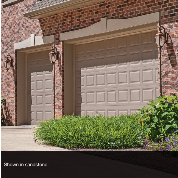
Shown in sandstone.